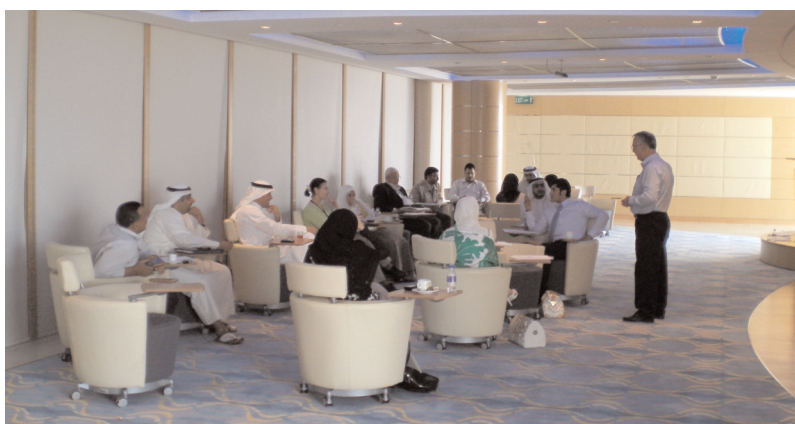
Community building in the Middle East