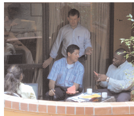
KM planning in the Caribbean

South America In South America, there is a great respect for Knowledge, and for the company experts. The knowledge held by these experts can be used as a real resource, and the role of the expert can be subtly altered so that they become the custodians of corporate knowledge, rather than the providers of personal knowledge. People who are not experts need to be reassured that their knowledge is also of value to the community, so that the knowledge base is not entirely expert-dominated.