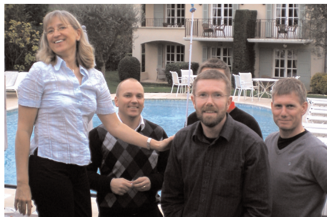
KM engagement in Scandinavia

Middle East Another oral culture, knowledge sharing is embedded into normal life in the Gulf, in the Douwania's , or talking circles, seen in many people's home. This type of peer-based informal exchange is likely to be far more productive than a more formal online approach,