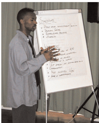
KM strategy in Africa

Africa This is a continent of many cultures. In some countries, the culture of oral story-telling is very ancient, and can easily be used in support of KM. South African society is an interesting mixture of ubuntu (which values