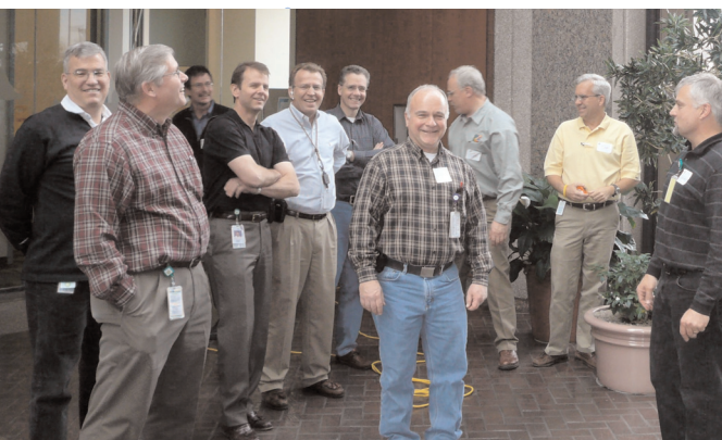
KM training in the USA

where corporate hierarchy can get in the way.