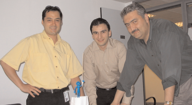
KM exercise in the former soviet union